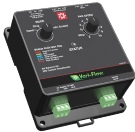
Air Balance Kit