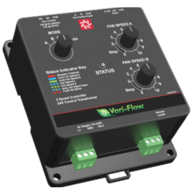
2 Speed Controller

Compatible with Cook's Vari-Flow Controls for superior part-load efficiency and demand-based controllability.