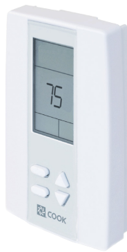
Universal Controller Temp/RH/VOC/CO 2