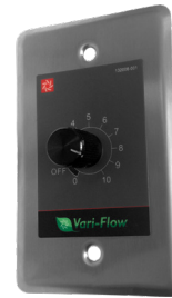
Remote Speed Controller