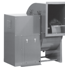
CPS / CPA / CPS-A / CPA-A Shown with weather cover

These COOK products must be ordered with drain and access door to comply with UL requirements. Weather covers are required for outdoor applications. When airstream temperatures are expected to exceed 180°F, high temperature accessories may be required.