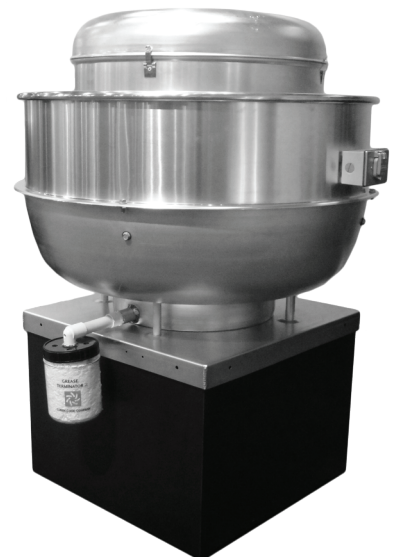
VCR shown with Grease Terminator 2