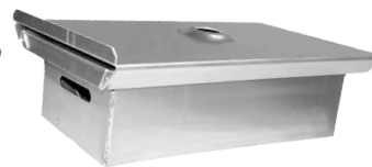
Non-Curb Mounted 'Hanging' Version