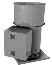
QMXU / QMXU-HP