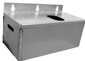
Curb Mounted Version

The grease trough is constructed of continuously welded .064 aluminum and includes a pan, lid and mounting hardware. Both the curb and non-curb mounted versions feature a baffled design for extended capacity. The lid and pan are removable for easy cleaning.