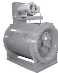
QMX / QMX-HP