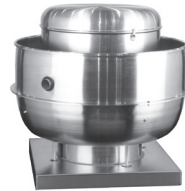
VCR / VCR-HP / VCR-XP / VCRD / VCRD-HP / VCRD-XP

CPV, CPA, CPA-A, QMX, QMX-HP and CIC must be ordered with drain and access door to comply with UL requirements. Weather covers are required for outdoor applications. When airstream temperatures are expected to exceed 180°F, high temperature accessories may be required.