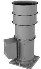
QMXLE / QMXLE-HP