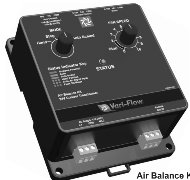
Air Balance Kit